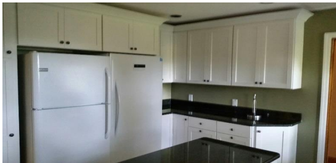
New Kitchen at Arborvale

Arborvale Manor is our community based Life Readiness Program for adolescent males ages 15 to 20. Our goal is to help guide young men through the difficult process of being in care and the extraordinarily difficult process of preparing themselves to leave care. Most of the young men we serve will have to make the transition to supporting and providing entirely for themselves within the near future. While this is an enormous challenge for any young adult, we have had some exciting results and experiences. The Arborvale Manor program continues to thrive with referrals for clients in need of services. Although our 8 bed program is relatively small, it's exciting to see the big changes and opportunities that our young men are achieving. While our clients are working hard to develop into successful young men, we are relentlessly working towards improving our services by identifying more supports, new opportunities, increased experiential learning, and improved facilities. Recently we were blessed to have the opportunity the complete an entire kitchen remodel for our program. This along with many other program improvements has allowed us to communicate to our clients that their worth is truly significant to us and we are here to invest in them!