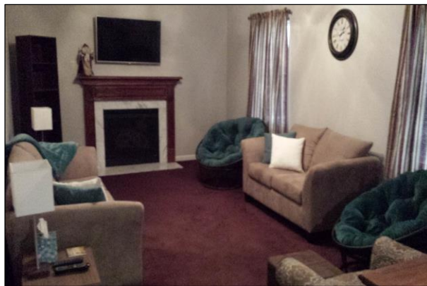
Living Room in Transitional House

Residents will prepare for discharge by seeking employment, housing and community support services in their chosen community following discharge.